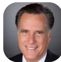
Governor Mitt Romney