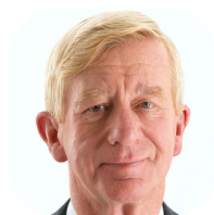
Governor William Weld