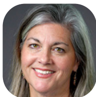
Governor Jane Swift