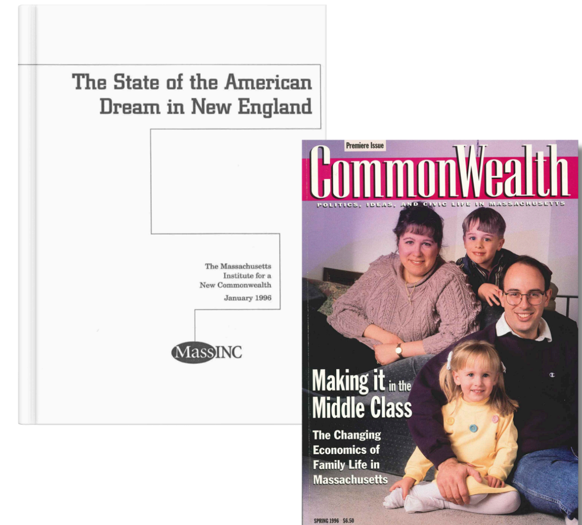
(Left): MassINC's inaugural research report, The State of the American Dream in New England , 1996.

For 30 years, we have worked to advance this vision with nonpartisan research, civic engagement, and independent journalism that informs our policy debates and holds our government accountable.