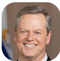
Governor Charlie Baker