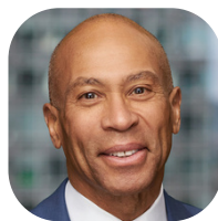
Governor Deval Patrick