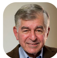
Governor Michael Dukakis