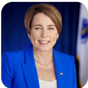
Governor Maura Healey

The Current and Past Governors of the Commonwealth of Massachusetts